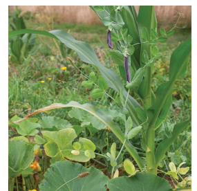
BOTANICAL BUDDIES: PAGE 6