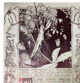
LOCAL ARTIST SHINES IN GIFT SHOP: PAGE 5