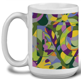
NEW ONLINE SHOP: PAGE 4