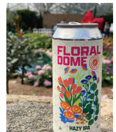
PARTNERSHIPS WITH LOCAL BUSINESSES: PAGE 7