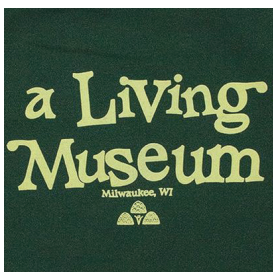
NEW IN THE GIFT SHOP: PAGE 5