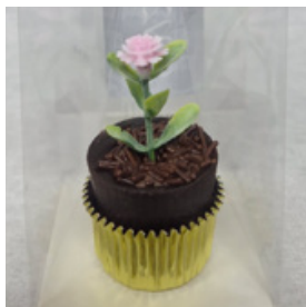
NEW TREATS FROM FAZIO'S IN THE GIFT SHOP: PAGE 4