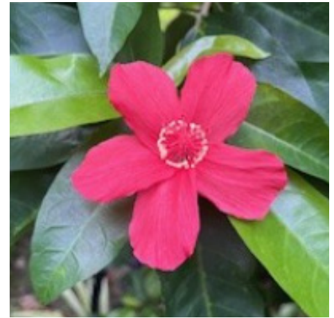
Hibiscus clayi in the Tropical Dome

Visit the Tropical Dome to enjoy this rare, special Hawaiian beauty! ■