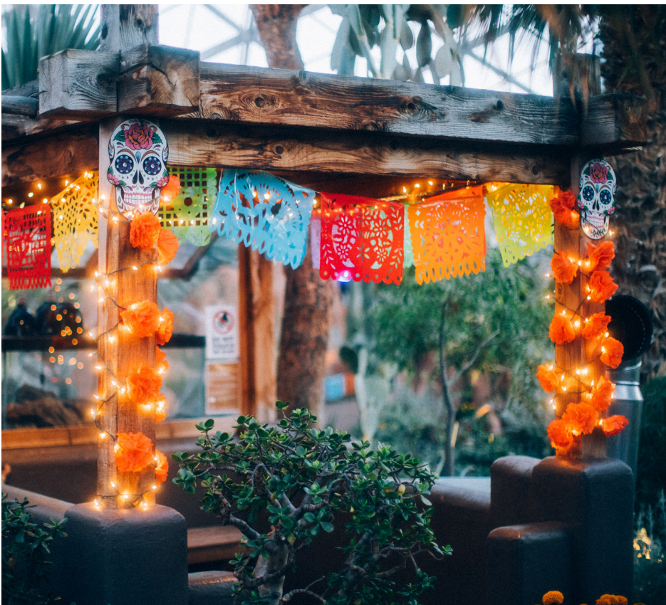
Traditional Decor Transforms the Desert Dome for one Special Night

This popular event will sell out and advance tickets are required! Visit MilwaukeeDomes.org/DDLM to purchase tickets today. ■