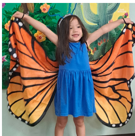
FAMILY FUN FEST "WINTER IN THE TROPICS": PAGE 5

THE NATURAL PLACE TO RECONNECT WITH SELF AND FRIENDS