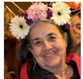
UPCOMING EVENTS AT THE DOMES: PAGES 7 AND 8