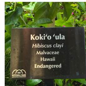
ENDANGERED HAWAIIAN HIBISCUS BLOOMS: PAGE 6

THE NATURAL PLACE TO RECONNECT WITH SELF AND FRIENDS